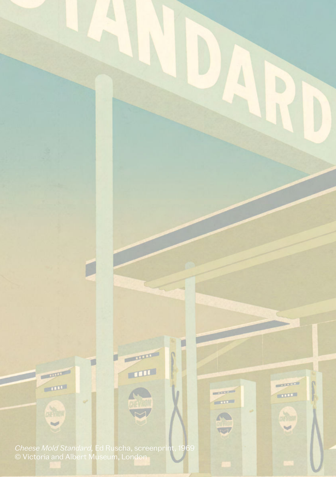
Cheese Mold Standard , Ed Ruscha, screenprint, 1969