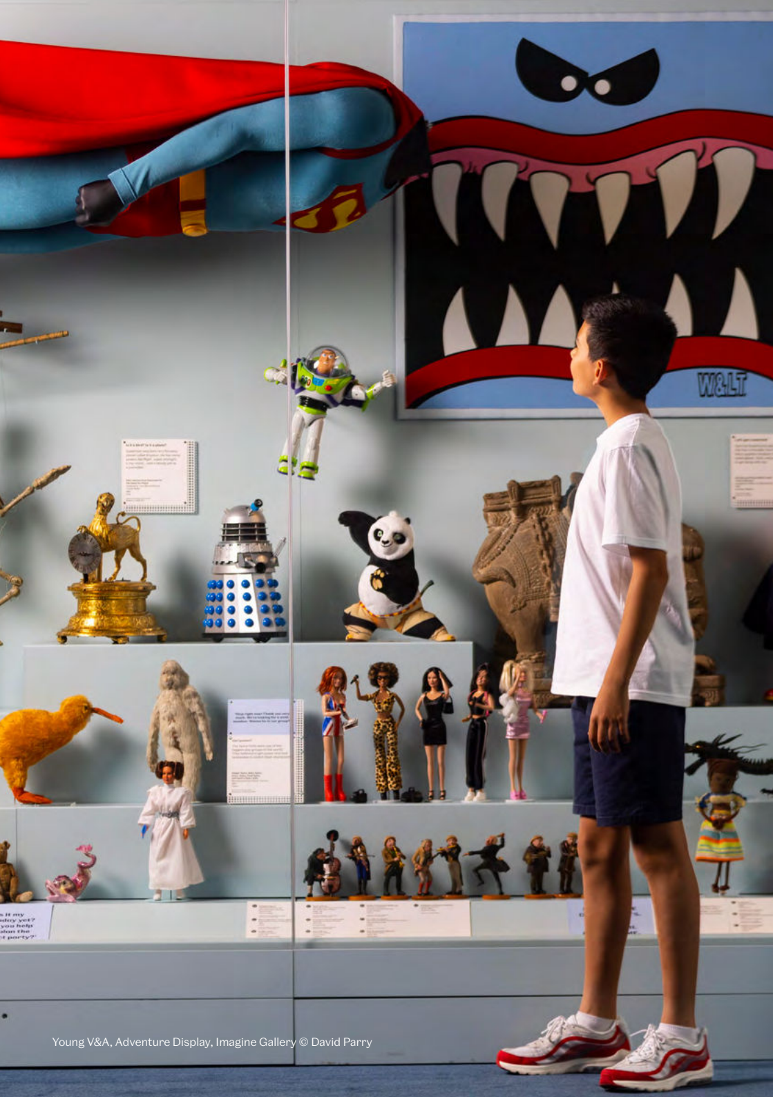
Young V&A, Adventure Display, Imagine Gallery