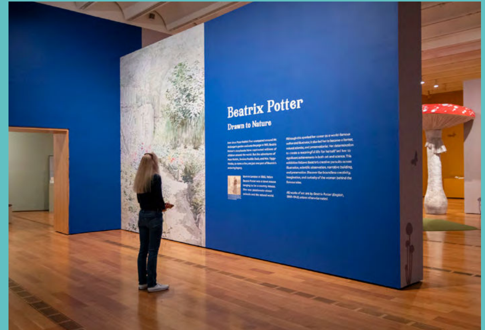
Beatrix Potter: Drawn to Nature, Morgan Library and Museum, New York, 2024.