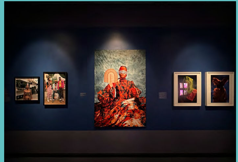
Africa Fashion, Brooklyn Museum, New York & Portland Art Museum, 2023.