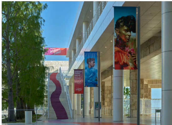
Tim Walker: Wonderful Things, The Getty, Los Angeles, 2023