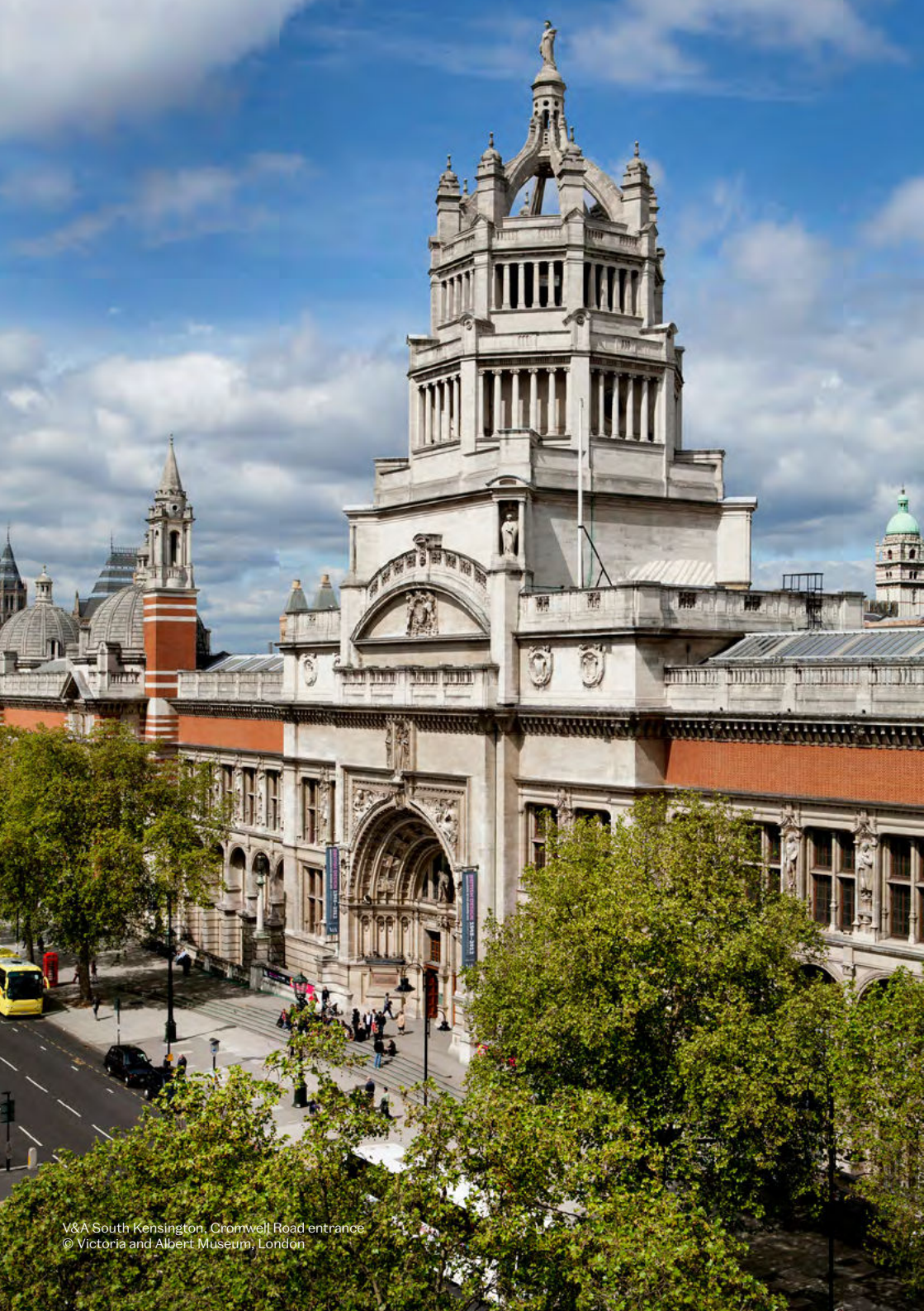
V&A South Kensington, Cromwell Road entrance