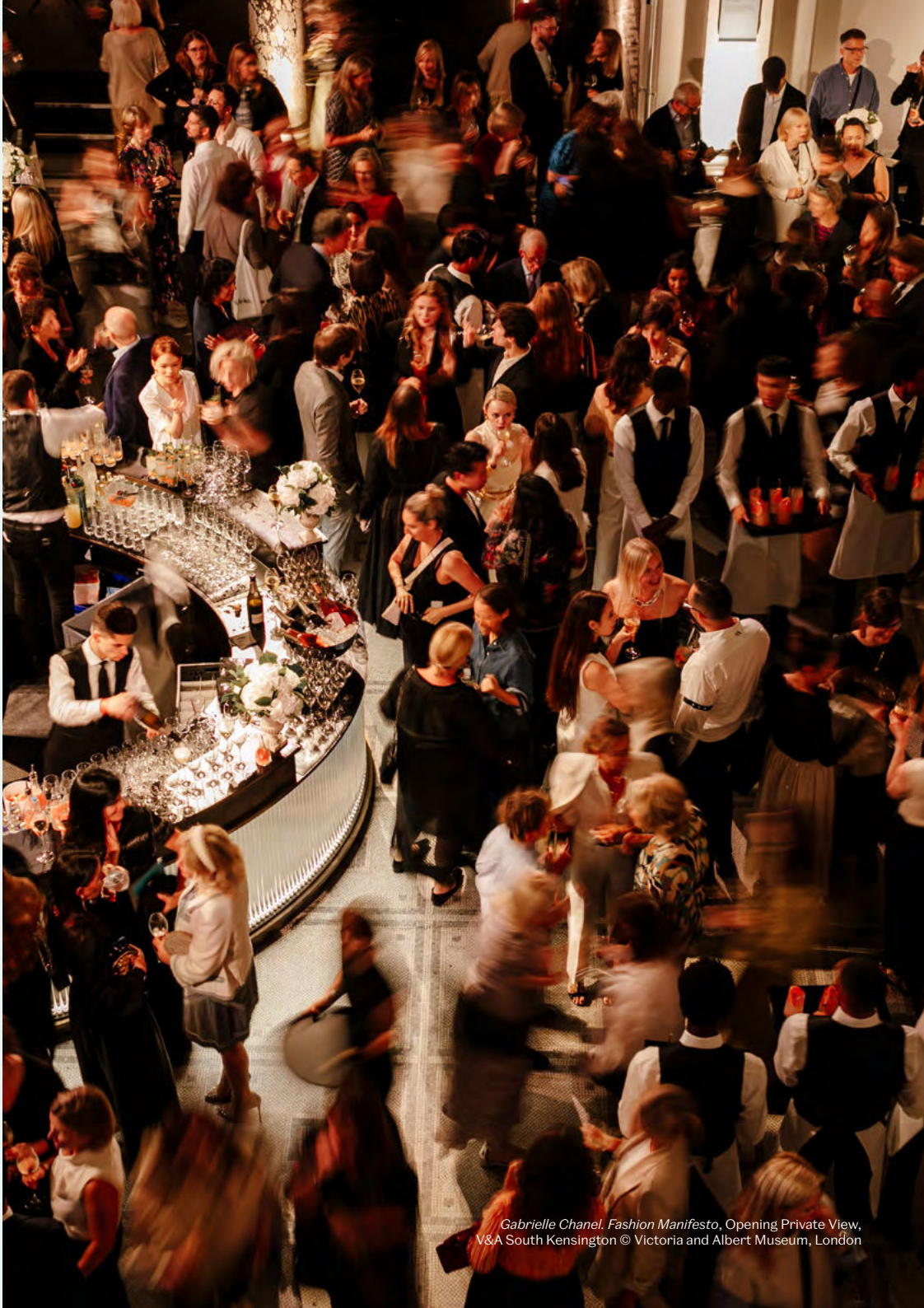
Gabrielle Chanel. Fashion Manifesto, Opening Private View, V&A South Kensington